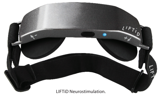
Actual device, color, logos, LED light, and other parts may vary in shape, size, design, color, and logo.